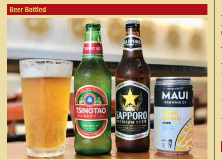
Tsingtao Lager 青島 | チンダオ