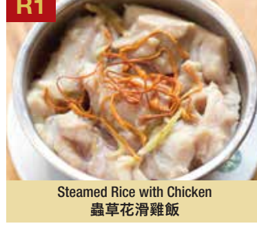
R1 Steamed Rice with Chicken 蟲草花滑雞飯