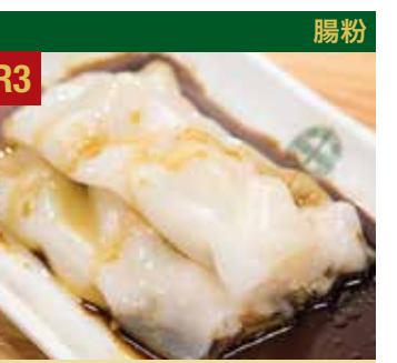
RR3 *Steamed Rice Roll with Shrimp and Chinese Chives 薑黃鮮蝦腸