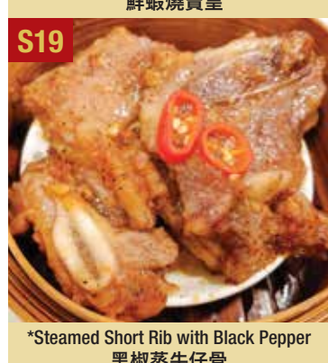
S19 *Steamed Short Rib with Black Pepper 黑椒蒸牛仔骨