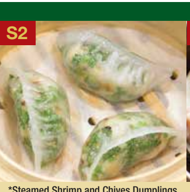
S2 *Steamed Shrimp and Chives Dumplings 鮮蝦韭菜餃