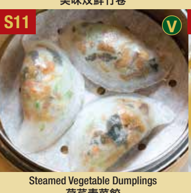
S11 Steamed Vegetable Dumplings 荷芹素菜餃