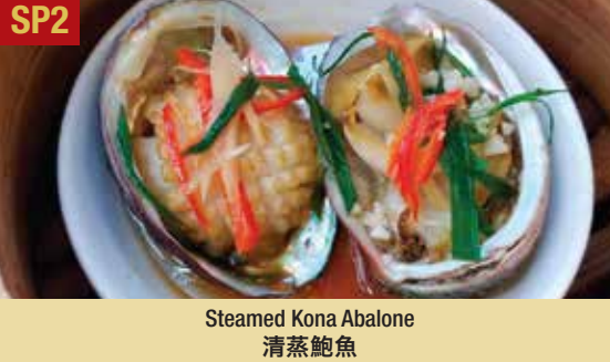
SP2 Steamed Kona Abalone 清蒸鮑魚