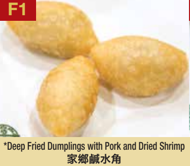
F1 *Deep Fried Dumplings with Pork and Dried Shrimp 家鄉鹹水角