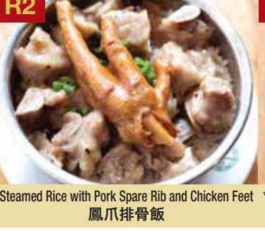
R2 Steamed Rice with Pork Spare Rib and Chicken Feet 鳳爪排骨飯