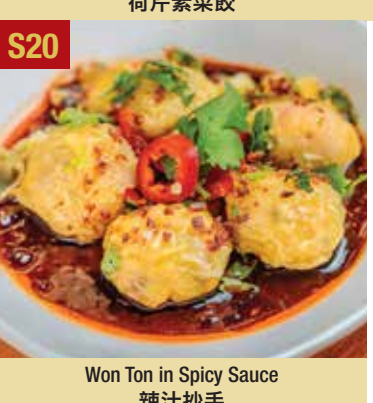
S20 Won Ton in Spicy Sauce 辣汁抄手