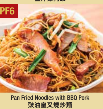
PF6 Pan Fried Noodles with BBQ Pork 豉油皇叉燒炒麵