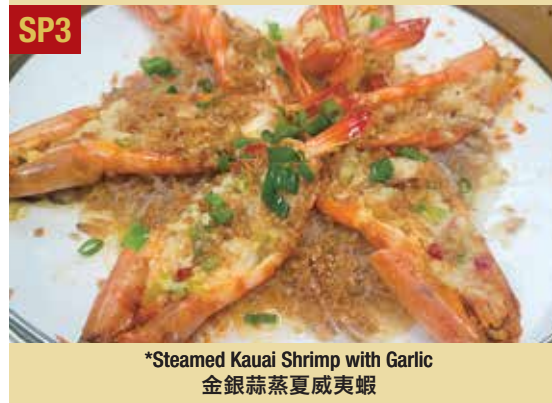
SP3 *Steamed Kauai Shrimp with Garlic 金銀蒜蒸夏威夷蝦