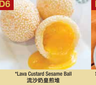
D6 *Lava Custard Sesame Ball 流沙奶皇煎堆