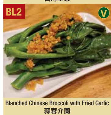
BL2 Blanching Chinese Broccoli with Fried Garlic 蒜蓉芥蘭