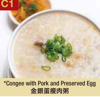
C1 *Congee with Pork and Preserved Egg 金銀蛋瘦肉粥