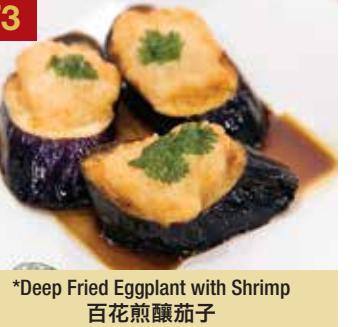
F3 *Deep Fried Eggplant with Shrimp 百花煎釀茄子