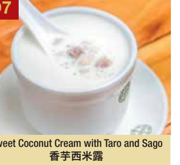
D7 Sweet Coconut Cream with Taro and Sago 香芋西米露