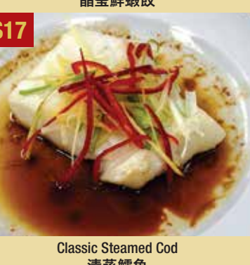
S17 Classic Steamed Cod 清蒸鱈魚