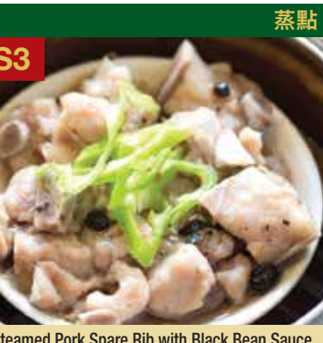
S3 Steamed Pork Spare Rib with Black Bean Sauce 豉汁蒸排骨