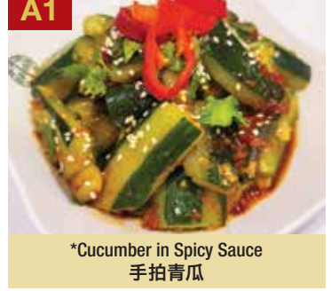
A1 *Cucumber in Spicy Sauce 手拍青瓜