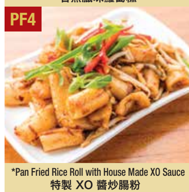
PF4 *Pan Fried Rice Roll with House Made XO Sauce 特製 XO 醬炒腸粉