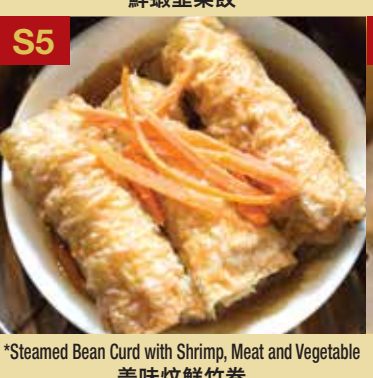
S5 *Steamed Bean Curd with Shrimp, Meat and Vegetable 美味炆鮮竹卷