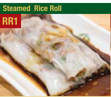
Steamed Rice Roll 腸粉 RR1 Steamed Rice Roll with BBQ Pork 蜜味叉燒腸

An 18% gratuity is suggested for parties of 6 or more