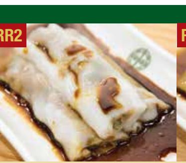
RR2 Steamed Rice Roll with Minced Beef 免治牛肉腸