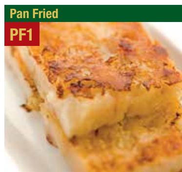
Pan Fried 煎點 PF1 *Pan Fried Turnip Cake 香煎臘味蘿蔔糕