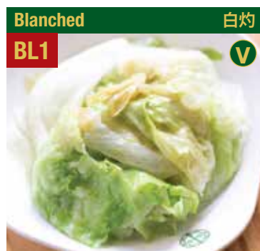
Blanching 白灼 BL1 Blanching Lettuce 白灼生菜