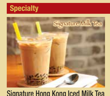
Specialty Signature Milk Tea 添好運招牌奶茶 香港アイスマルクティー