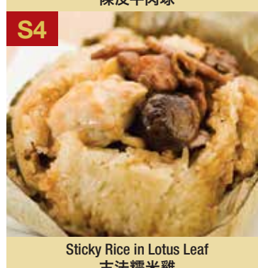
S4 Sticky Rice in Lotus Leaf 古法糯米雞