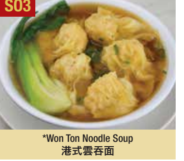
S03 *Won Ton Noodle Soup 港式雲吞面