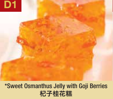
D1 *Sweet Osmanthus Jelly with Goji Berries 杞子桂花糕