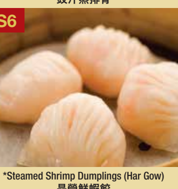
S6 *Steamed Shrimp Dumplings (Har Gow) 晶瑩鮮蝦餃