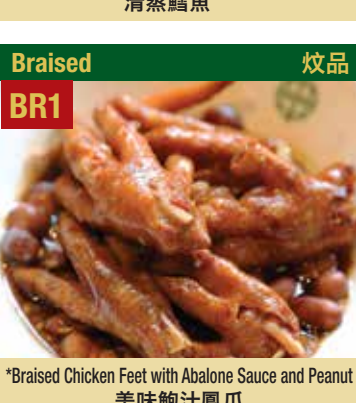
Braised 炆品 BR1 *Braised Chicken Feet with Abalone Sauce and Peanut 美味鮑汁鳳爪