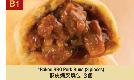
B1 *Baked BBQ Pork Buns (3 pieces) 酥皮焗叉燒包 3個