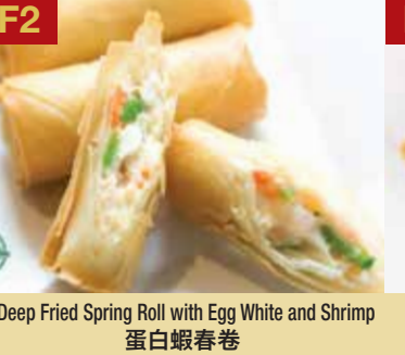
F2 *Deep Fried Spring Roll with Egg White and Shrimp 蛋白蝦春卷