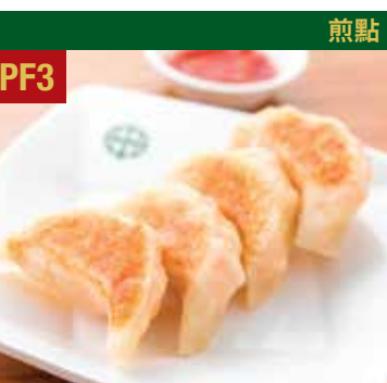
PF3 Pan Fried Chicken Dumplings with Ginger Essence 薑汁雞肉餃