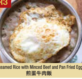
R3 *Steamed Rice with Minced Beef and Pan Fried Egg 煎蛋牛肉飯