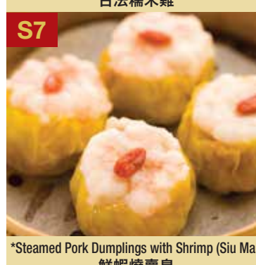
S7 *Steamed Pork Dumplings with Shrimp (Siu Mai) 鮮蝦燒賣皇