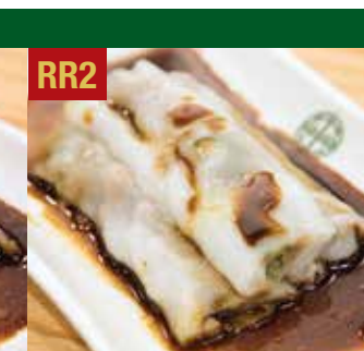
Steamed Rice Roll with Minced Beef 免治牛肉腸