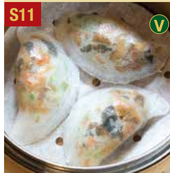
Steamed Vegetable Dumplings 荷芹素菜餃