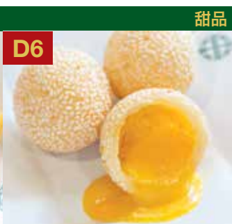
*Lava Custard Sesame Ball 流沙奶皇煎堆