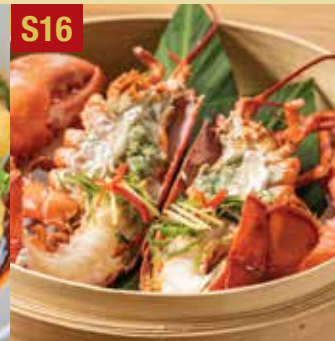
*Steamed Maine Lobster 清蒸龍蝦