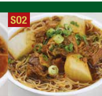
Braised Beef Brisket with Thin Rice Noodles in Soup 牛腩湯米粉