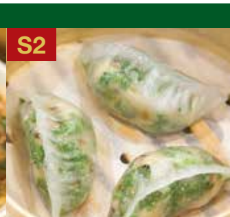
*Steamed Dumplings with Shrimp and Chives 鮮蝦韭菜餃