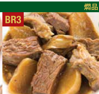
Braised Beef Brisket with Turnip (Daikon) 柱侯蘿蔔牛坑腩