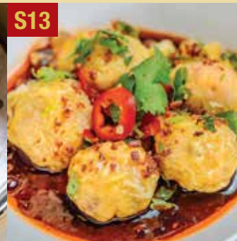
*Wontons in Hot and Spicy Sauce 紅油抄手