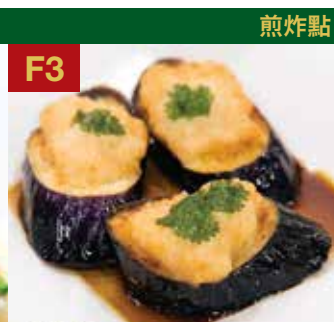
*Deep Fried Eggplant with Shrimp 百花煎釀茄子