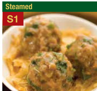
Steamed Beef Balls with Bean Curd Skin 陳皮牛肉球