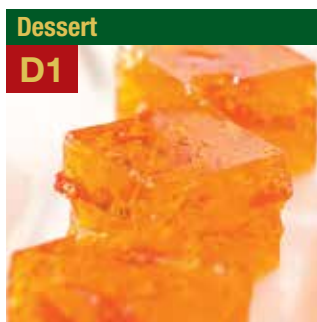
Sweet Osmanthus Jelly with Goji Berries 杞子桂花糕