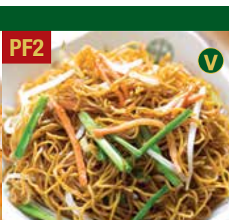
Pan Fried Noodles 豉油皇炒麵