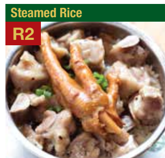
Steamed Rice with Pork Spare Rib and Chicken Feet 排骨鳳爪飯