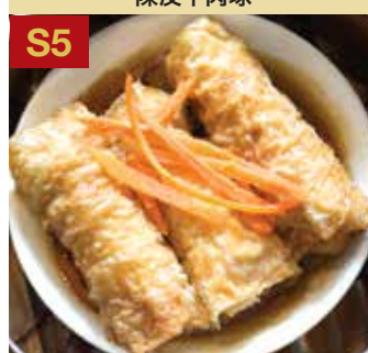
*Steamed Bean Curd with Shrimp, Meat and Vegetable 美味炆鮮竹卷