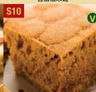
*Steamed Egg Cake 香滑馬拉糕