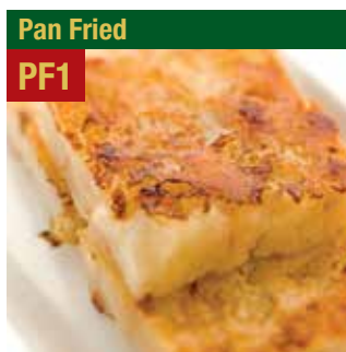
*Pan Fried Turnip Cake 香煎臘味蘿蔔糕