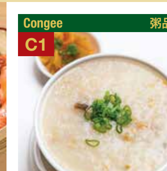
*Congee with Pork and Preserved Egg 金銀蛋瘦肉粥

Irvine TimHoWanUSA.com Follow us on @TimHoWanUSA Gift Cards Available