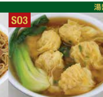
*Wonton Noodle Soup 雲吞麵