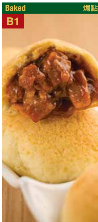
*Baked BBQ Pork Buns (3 pieces) 酥皮焗叉燒包 3個