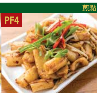
*Pan Fried Rice Roll with House Made XO sauce 特製 XO 醬炒腸粉