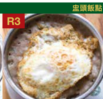
*Steamed Rice with Minced Beef and Pan Fried Egg 煎蛋牛肉飯