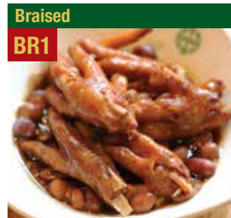
*Braised Chicken Feet with Abalone Sauce and Peanut 美味鮑汁鳳爪