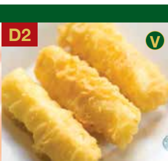
*Fried Silky Milk Sticks 炸鮮奶