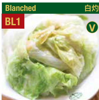
Blanched Lettuce 白灼生菜