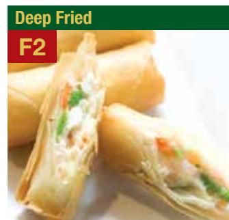
*Deep Fried Spring Roll with Egg White and Shrimp 蛋白蝦春卷