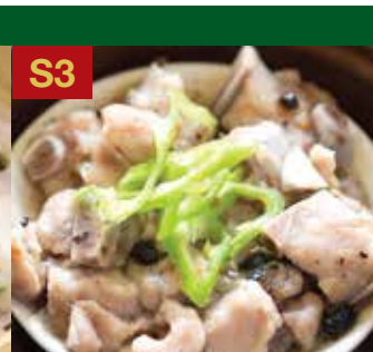
Steamed Pork Spare Rib with Black Bean Sauce 豉汁蒸排骨