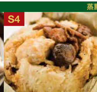
Sticky Rice in Lotus Leaf 古法糯米雞