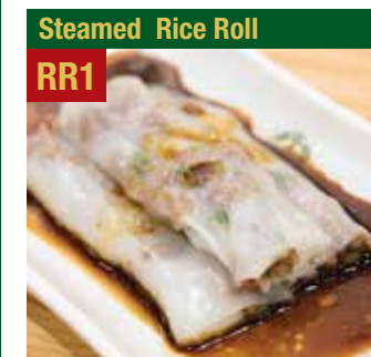
Steamed Rice Roll with BBQ Pork 蜜味叉燒腸

An 18% gratuity is suggested for parties of 6 or more