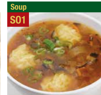
*Hot and Sour Wonton Soup 酸辣雲吞湯