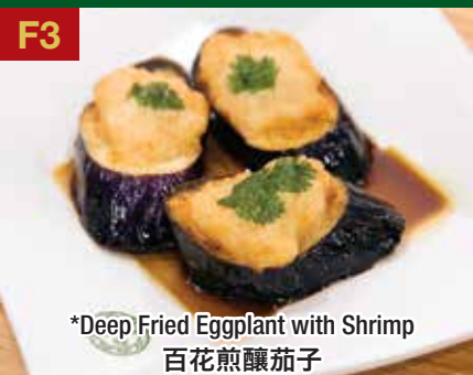
*Deep Fried Eggplant with Shrimp 百花煎釀茄子