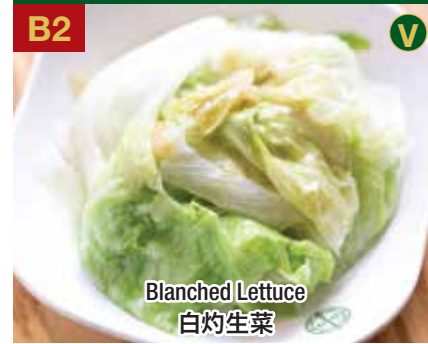
Blanched Lettuce 白灼生菜