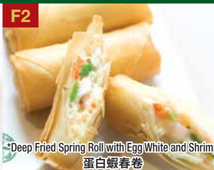
*Deep Fried Spring Roll with Egg White and Shrimp 蛋白蝦春卷