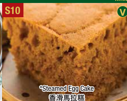
*Steamed Egg Cake 香滑馬拉糕