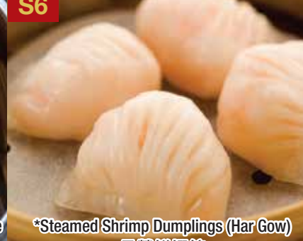
*Steamed Shrimp Dumplings (Har Gow) 晶瑩鮮蝦餃