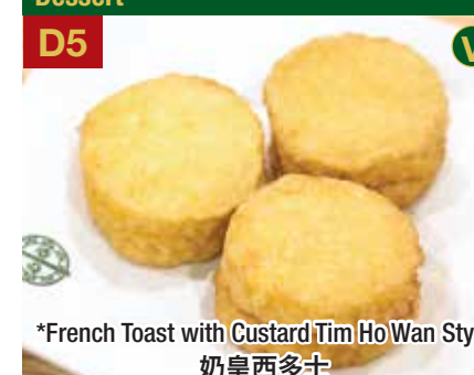
*French Toast with Custard Tim Ho Wan Style 奶皇西多士