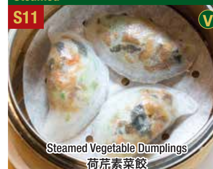
Steamed Vegetable Dumplings 荷芹素菜餃