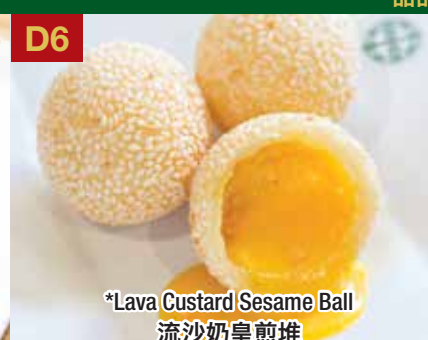
*Lava Custard Sesame Ball 流沙奶皇煎堆