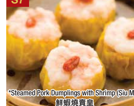
*Steamed Pork Dumplings with Shrimp (Siu Mai) 鮮蝦燒賣皇