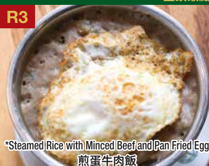
*Steamed Rice with Minced Beef and Pan Fried Egg 煎蛋牛肉飯