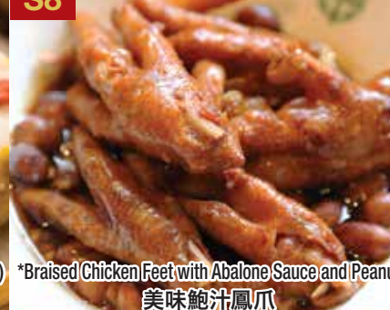
*Braised Chicken Feet with Abalone Sauce and Peanut 美味鮑汁鳳爪