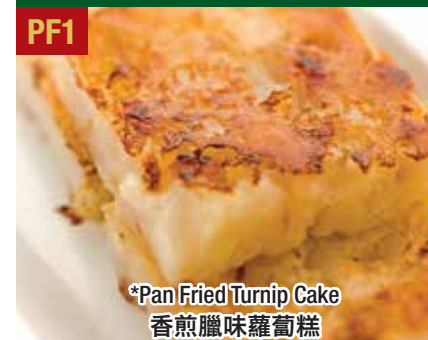
*Pan Fried Turnip Cake 香煎臘味蘿蔔糕