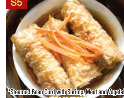
*Steamed Bean Curd with Shrimp, Meat and Vegetable 美味炆鮮竹卷