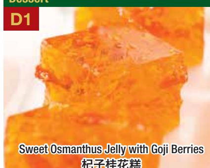
Sweet Osmanthus Jelly with Goji Berries 杞子桂花糕