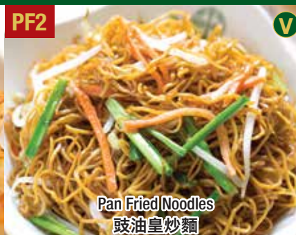
Pan Fried Noodles 豉油皇炒麵