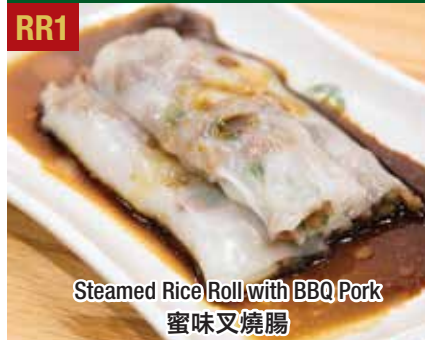
Steamed Rice Roll with BBQ Pork 蜜味叉燒腸