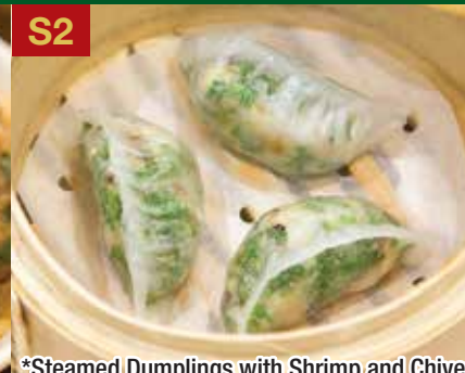
*Steamed Dumplings with Shrimp and Chives 鮮蝦韭菜餃