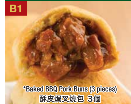
*Baked BBQ Pork Buns (3 pieces) 酥皮焗叉燒包 3個