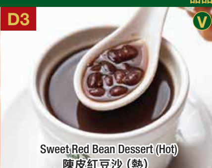
Sweet Red Bean Dessert (Hot) 陳皮紅豆沙(熱)