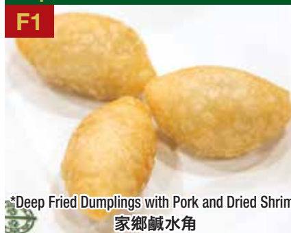
*Deep Fried Dumplings with Pork and Dried Shrimp 家鄉鹹水角