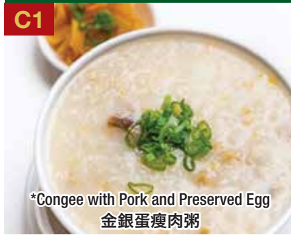
*Congee with Pork and Preserved Egg 金銀蛋瘦肉粥