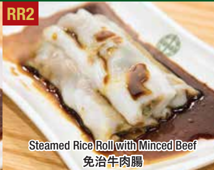
Steamed Rice Roll with Minced Beef 免治牛肉腸