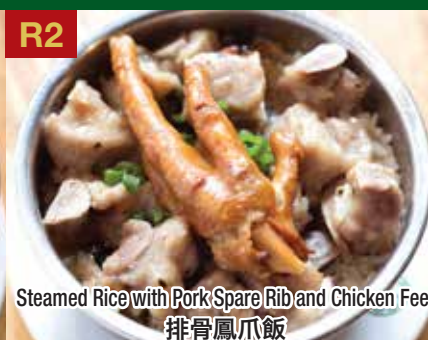
Steamed Rice with Pork Spare Rib and Chicken Feet 排骨鳳爪飯