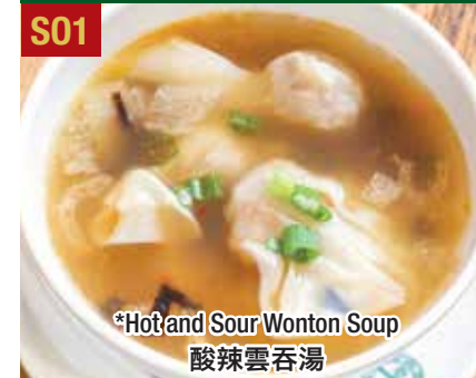
*Hot and Sour Wonton Soup 酸辣雲吞湯