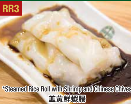
*Steamed Rice Roll with Shrimp and Chinese Chives 韭黃鮮蝦腸