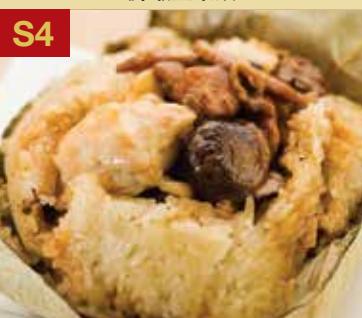
S4 Sticky Rice in Lotus Leaf 古法糯米雞