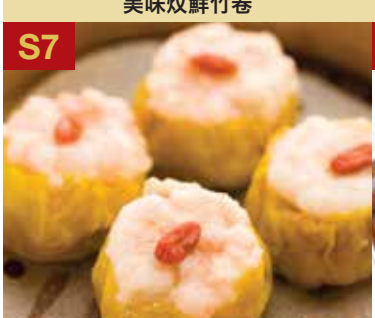
S7 *Steamed Pork Dumplings with Shrimp (Siu Mai) 鮮蝦燒賣皇