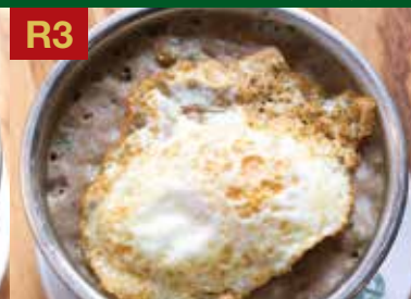
R3 *Steamed Rice with Minced Beef and Pan Fried Egg 煎蛋牛肉飯