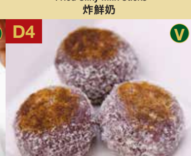
D4 *Pan Fried Black Rice Mochi with Pineapple 香煎菠蘿茸紫米糍