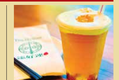
Rainbow Mango Slush 彩虹芒果冰沙 レインボーマンゴースラッシュ $5.75