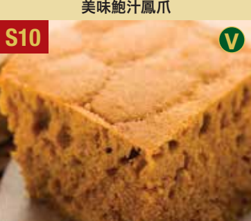
S10 *Steamed Egg Cake 香滑馬拉糕