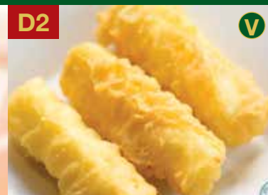
D2 *Fried Silky Milk Sticks 炸鮮奶