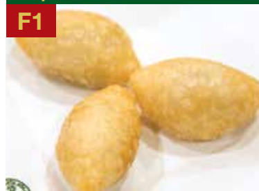
F1 *Deep Fried Dumplings with Pork and Dried Shrimp 家鄉鹹水角