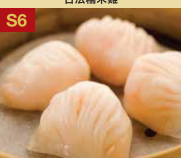
S6 *Steamed Shrimp Dumplings (Har Gow) 晶瑩鮮蝦餃