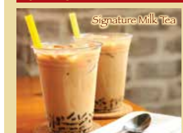
Signature Hong Kong Iced Milk Tea 添好運招牌奶茶 香港アイスミルクティー $5.50