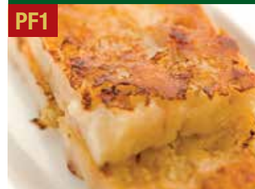
PF1 *Pan Fried Turnip Cake 香煎臘味蘿蔔糕