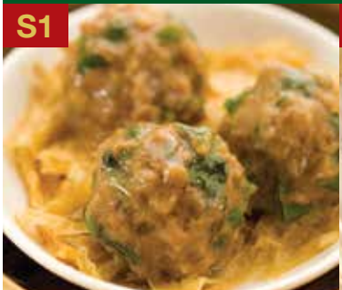
S1 Steamed Beef Balls with Bean Curd Skin 陳皮牛肉球