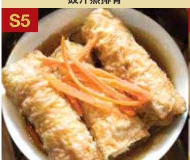
S5 *Steamed Bean Curd with Shrimp, Meat and Vegetable 美味炆鮮竹卷