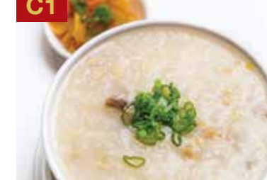
C1 *Congee with Pork and Preserved Egg 金銀蛋瘦肉粥