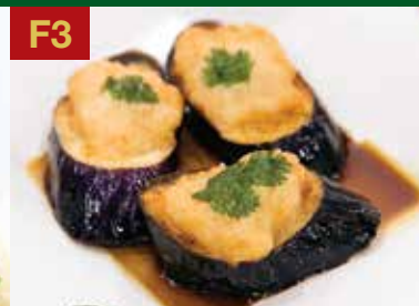
F3 *Deep Fried Eggplant with Shrimp 百花煎釀茄子