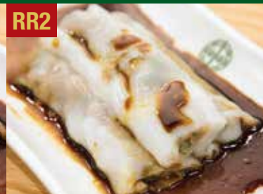
RR2 Steamed Rice Roll with Minced Beef 免治牛肉腸