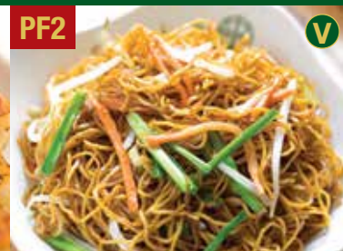
PF2 Pan Fried Noodles 豉油皇炒麵