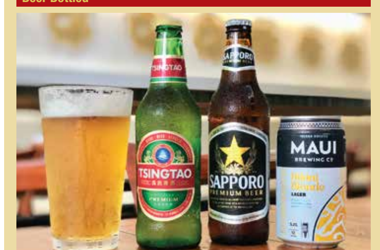
Tsingtao Lager 青島 | チンタオ $7.50