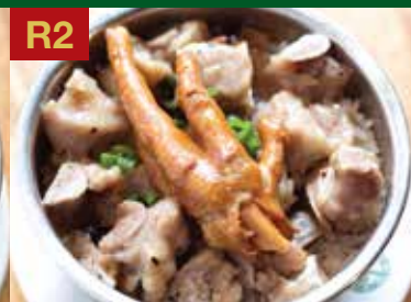
R2 Steamed Rice with Pork Spare Rib and Chicken Feet 鳳爪排骨飯