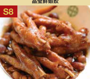
S8 *Braised Chicken Feet with Abalone Sauce and Peanut 美味鮑汁鳳爪