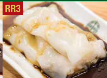
RR3 *Steamed Rice Roll with Shrimp and Chinese Chives 韭黃鮮蝦腸