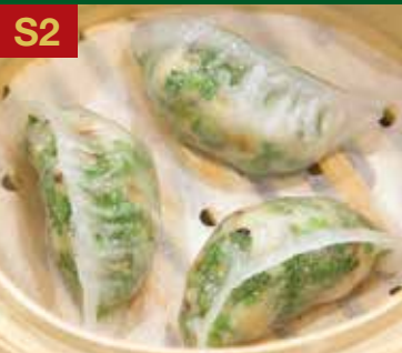
S2 *Steamed Shrimp and Chives Dumplings 鮮蝦韭菜餃