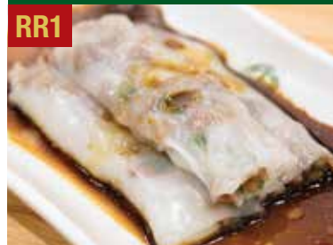
RR1 Steamed Rice Roll with BBQ Pork 蜜味叉燒腸