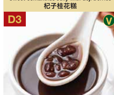
D3 Sweet Red Bean Dessert (Hot) 陳皮紅豆沙 (熱)