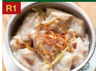
R1 Steamed Rice with Chicken 蟲草花滑雞飯