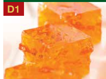
D1 Sweet Osmanthus Jelly with Goji Berries 杞子桂花糕