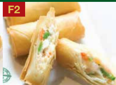
F2 *Deep Fried Spring Roll with Egg White and Shrimp 蛋白蝦春卷