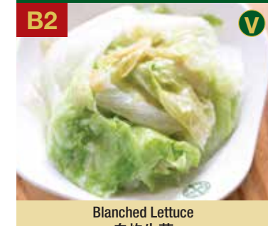
B2 Blanched Lettuce 白灼生菜