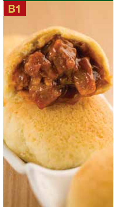
B1 *Baked BBQ Pork Buns (3 pieces) 酥皮焗叉燒包 3個