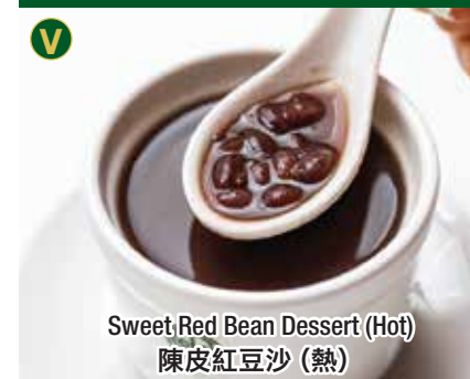
Sweet Red Bean Dessert (Hot) 陳皮紅豆沙(熱)