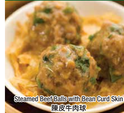
Steamed Beef Balls with Bean Curd Skin 陳皮牛肉球