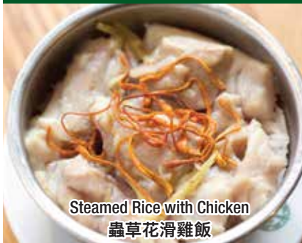
Steamed Rice with Chicken 蟲草花滑雞飯