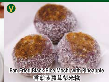
Pan Fried Black Rice Mochi with Pineapple 香煎菠蘿茸紫米糍