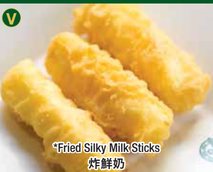
*Fried Silky Milk Sticks 炸鮮奶