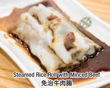
Steamed Rice Roll with Minced Beef 免治牛肉腸