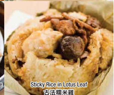
Sticky Rice in Lotus Leaf 古法糯米雞