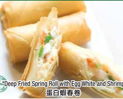
*Deep Fried Spring Roll with Egg White and Shrimp 蛋白蝦春卷