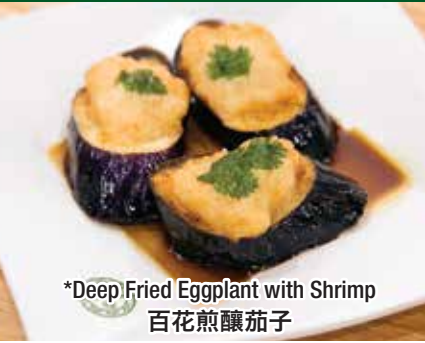
*Deep Fried Eggplant with Shrimp 百花煎釀茄子