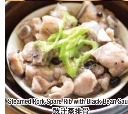
Steamed Pork Spare Rib with Black Bean Sauce 豉汁蒸排骨