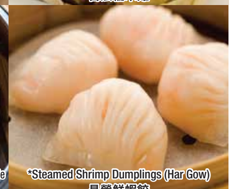
*Steamed Shrimp Dumplings (Har Gow) 晶瑩鮮蝦餃