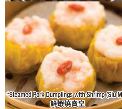
*Steamed Pork Dumplings with Shrimp (Siu Mai) 鮮蝦燒賣皇