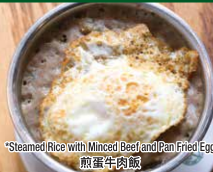
*Steamed Rice with Minced Beef and Pan Fried Egg 煎蛋牛肉飯