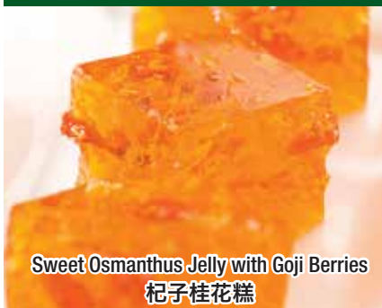
Sweet Osmanthus Jelly with Goji Berries 杞子桂花糕