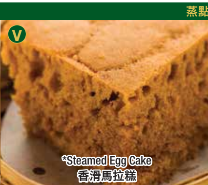
*Steamed Egg Cake 香滑馬拉糕