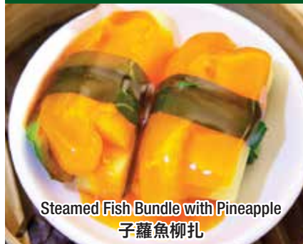
Steamed Fish Bundle with Pineapple 子蘿魚柳扎