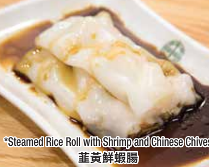
*Steamed Rice Roll with Shrimp and Chinese Chives 韭黃鮮蝦腸