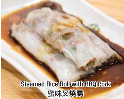
Steamed Rice Roll with BBQ Pork 蜜味叉燒腸