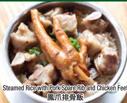
Steamed Rice with Pork Spare Rib and Chicken Feet 鳳爪排骨飯