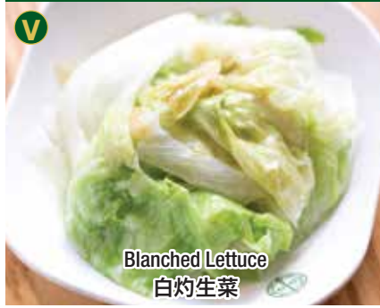
Blanched Lettuce 白灼生菜