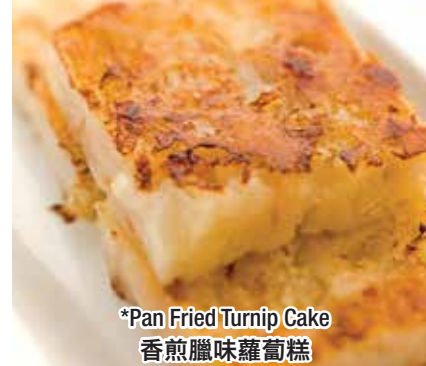
*Pan Fried Turnip Cake 香煎臘味蘿蔔糕