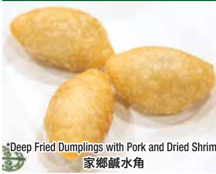
*Deep Fried Dumplings with Pork and Dried Shrimp 家鄉鹹水角