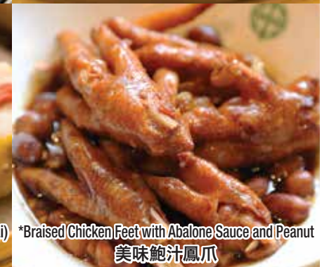
*Braised Chicken Feet with Abalone Sauce and Peanut 美味鮑汁鳳爪