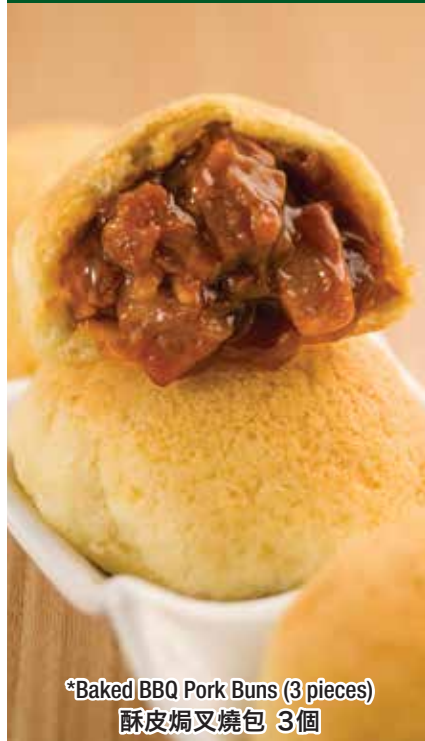
*Baked BBQ Pork Buns (3 pieces) 酥皮焗叉燒包 3個