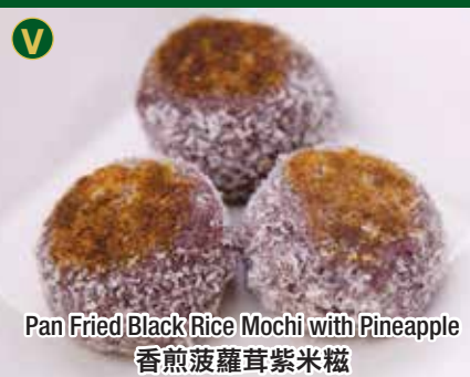
Pan Fried Black Rice Mochi with Pineapple 香煎菠蘿茸紫米糰