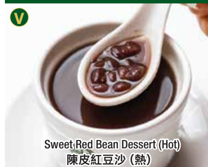
Sweet Red Bean Dessert (Hot) 陳皮紅豆沙 (熱)