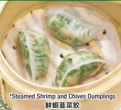
*Steamed Shrimp and Chives Dumplings 鮮蝦韭菜餃