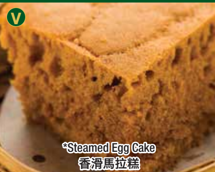
*Steamed Egg Cake 香滑馬拉糕