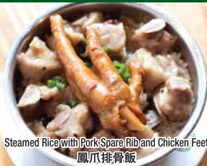
Steamed Rice with Pork Spare Rib and Chicken Feet 鳳爪排骨飯