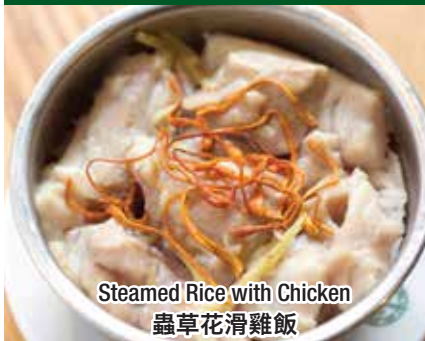
Steamed Rice with Chicken 蟲草花滑雞飯