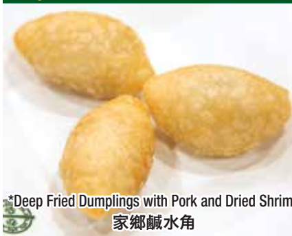
*Deep Fried Dumplings with Pork and Dried Shrimp 家鄉鹹水角