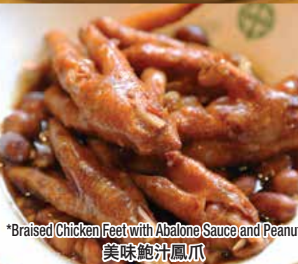
*Braised Chicken Feet with Abalone Sauce and Peanut 美味鮑汁鳳爪