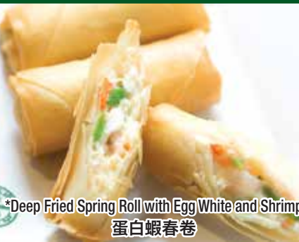
*Deep Fried Spring Roll with Egg White and Shrimp 蛋白蝦春卷