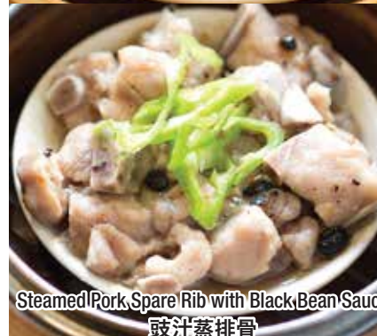
Steamed Pork Spare Rib with Black Bean Sauce 豉汁蒸排骨