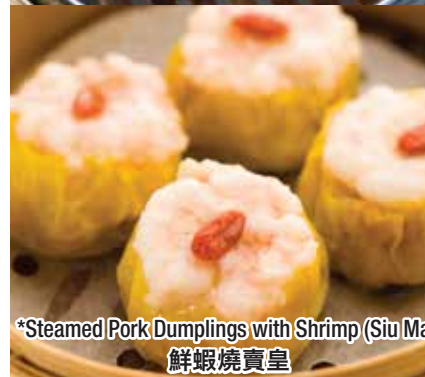
*Steamed Pork Dumplings with Shrimp (Siu Mai) 鮮蝦燒賣皇