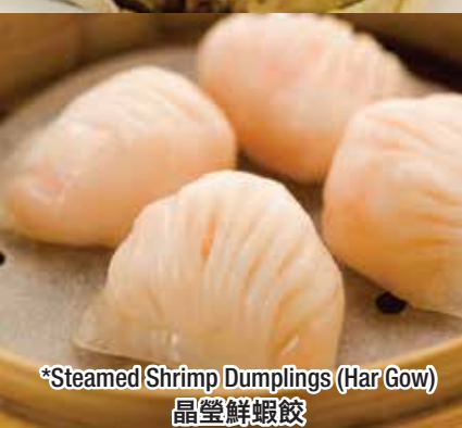
*Steamed Shrimp Dumplings (Har Gow) 晶瑩鮮蝦餃