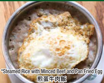
*Steamed Rice with Minced Beef and Pan Fried Egg 煎蛋牛肉飯