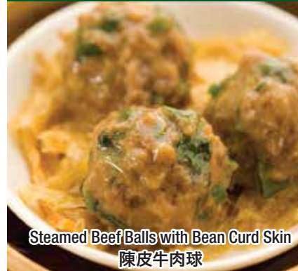
Steamed Beef Balls with Bean Curd Skin 陳皮牛肉球