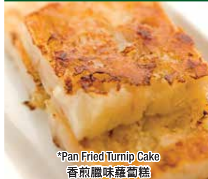
*Pan Fried Turnip Cake 香煎臘味蘿蔔糕