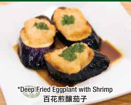
*Deep Fried Eggplant with Shrimp 百花煎釀茄子