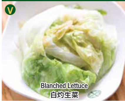
Blanched Lettuce 白灼生菜