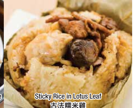
Sticky Rice in Lotus Leaf 古法糯米雞