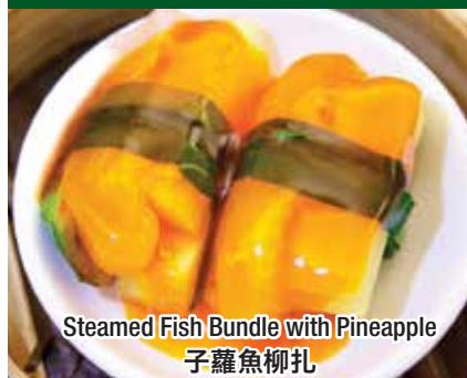
Steamed Fish Bundle with Pineapple 子蘿魚柳扎