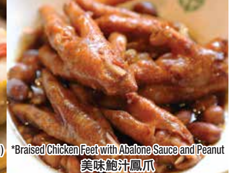
*Braised Chicken Feet with Abalone Sauce and Peanut 美味鮑汁鳳爪