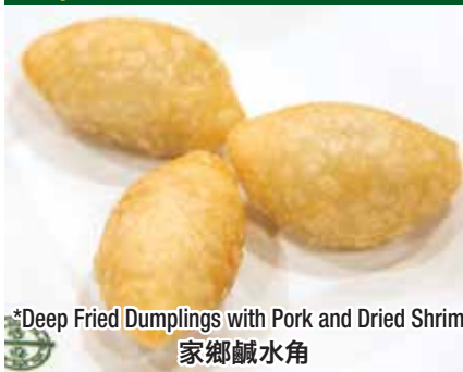
*Deep Fried Dumplings with Pork and Dried Shrimp 家鄉鹹水角