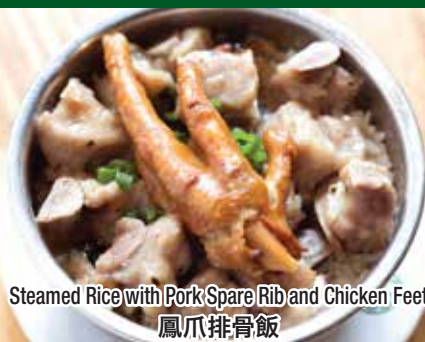
Steamed Rice with Pork Spare Rib and Chicken Feet 鳳爪排骨飯