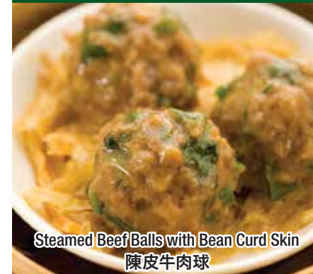
Steamed Beef Balls with Bean Curd Skin 陳皮牛肉球