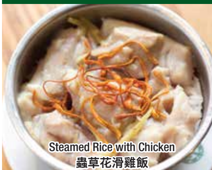
Steamed Rice with Chicken 蟲草花滑雞飯