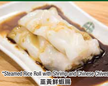
*Steamed Rice Roll with Shrimp and Chinese Chives 韭黃鮮蝦腸