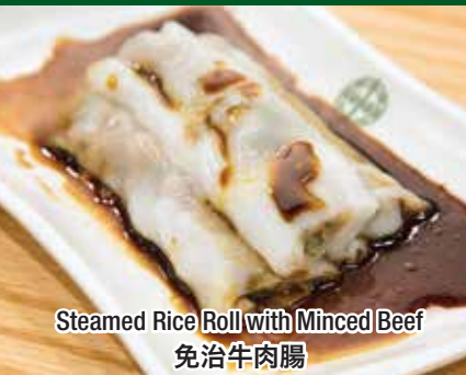
Steamed Rice Roll with Minced Beef 免治牛肉腸