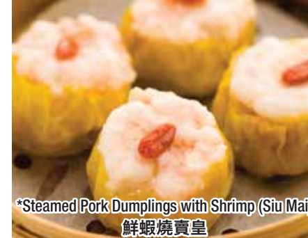
*Steamed Pork Dumplings with Shrimp (Siu Mai) 鮮蝦燒賣皇