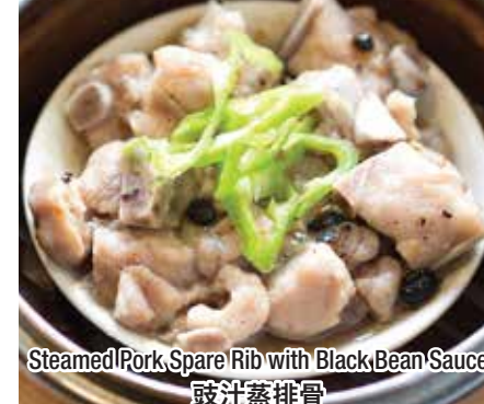
Steamed Pork Spare Rib with Black Bean Sauce 豉汁蒸排骨