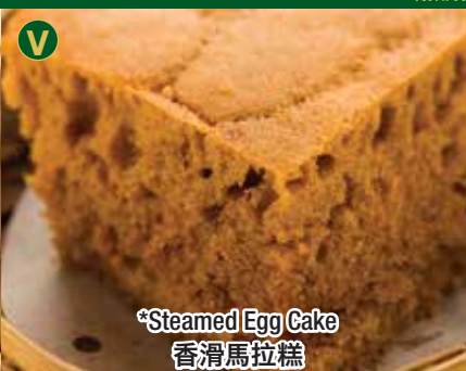
*Steamed Egg Cake 香滑馬拉糕