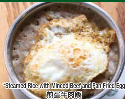
*Steamed Rice with Minced Beef and Pan Fried Egg 煎蛋牛肉飯