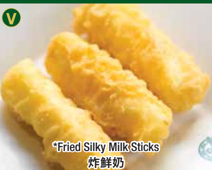
*Fried Silky Milk Sticks 炸鮮奶