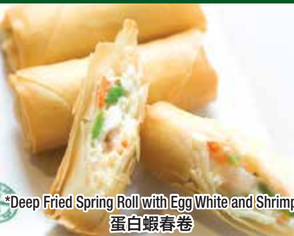
*Deep Fried Spring Roll with Egg White and Shrimp 蛋白蝦春卷