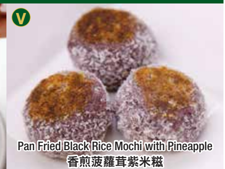
Pan Fried Black Rice Mochi with Pineapple 香煎菠蘿茸紫米糰