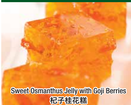
Sweet Osmanthus Jelly with Goji Berries 杞子桂花糕