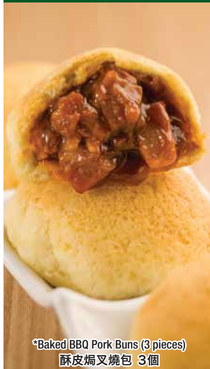
*Baked BBQ Pork Buns (3 pieces) 酥皮焗叉燒包 3個