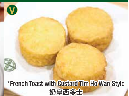
*French Toast with Custard Tim Ho Wan Style 奶皇西多士