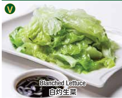
Blanched Lettuce 白灼生菜