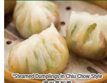
*Steamed Dumplings in Chiu Chow Style 潮州蒸粉果