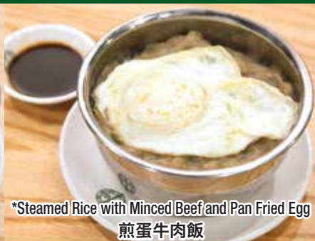
*Steamed Rice with Minced Beef and Pan Fried Egg 煎蛋牛肉飯