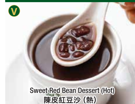
Sweet Red Bean Dessert (Hot) 陳皮紅豆沙 (熱)