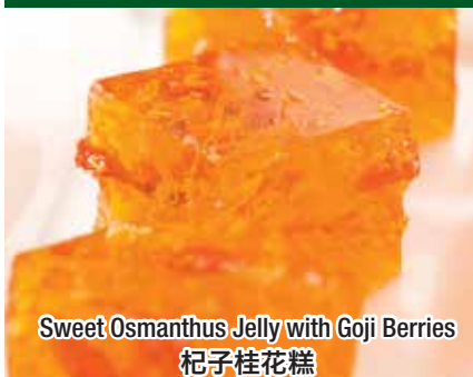
Sweet Osmanthus Jelly with Goji Berries 杞子桂花糕