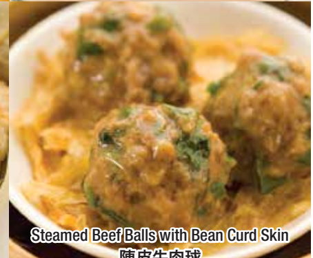
Steamed Beef Balls with Bean Curd Skin 陳皮牛肉球