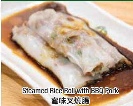
Steamed Rice Roll with BBQ Pork 蜜味叉燒腸