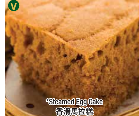
*Steamed Egg Cake 香滑馬拉糕