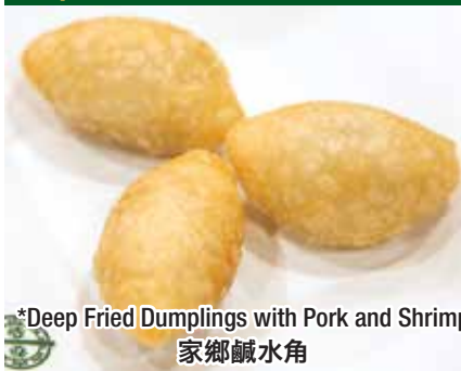
*Deep Fried Dumplings with Pork and Shrimp 家鄉鹹水角