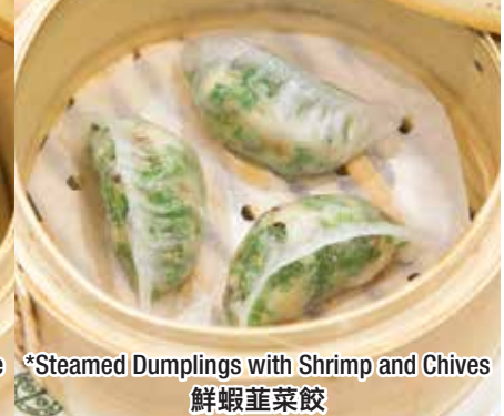
*Steamed Dumplings with Shrimp and Chives 鮮蝦韭菜餃