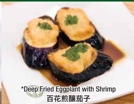
*Deep Fried Eggplant with Shrimp 百花煎釀茄子