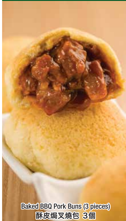
Baked BBQ Pork Buns (3 pieces) 酥皮焗叉燒包 3個