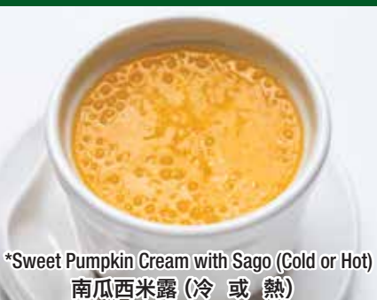
*Sweet Pumpkin Cream with Sago (Cold or Hot) 南瓜西米露 (冷或熱)