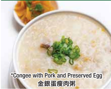
*Congee with Pork and Preserved Egg 金銀蛋瘦肉粥