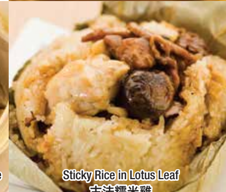
Sticky Rice in Lotus Leaf 古法糯米雞