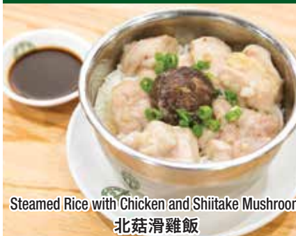
Steamed Rice with Chicken and Shiitake Mushroom 北菇滑雞飯