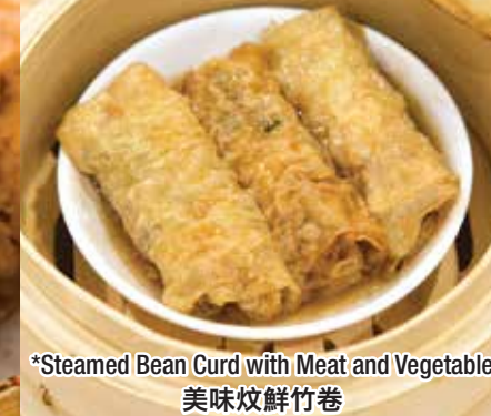
*Steamed Bean Curd with Meat and Vegetable 美味炆鮮竹卷