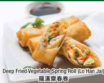
Deep Fried Vegetable Spring Roll (Lo Han Jai) 羅漢齋春卷