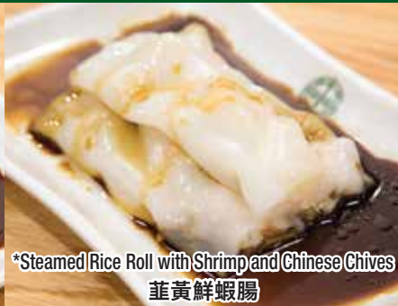
*Steamed Rice Roll with Shrimp and Chinese Chives 韭黃鮮蝦腸