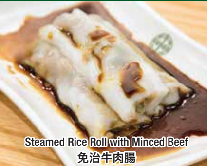
Steamed Rice Roll with Minced Beef 免治牛肉腸