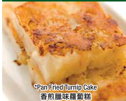
*Pan Fried Turnip Cake 香煎臘味蘿蔔糕