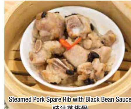
Steamed Pork Spare Rib with Black Bean Sauce 豉汁蒸排骨