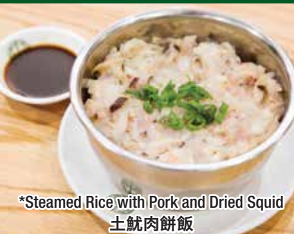
*Steamed Rice with Pork and Dried Squid 土魷肉餅飯