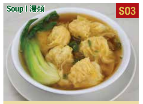
*Wonton Noodle Soup 雲吞麺