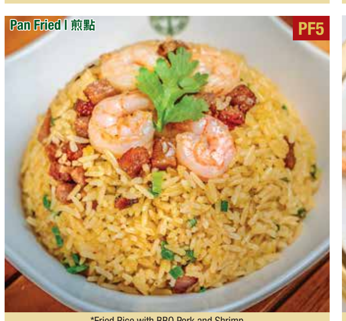
*Fried Rice with BBQ Pork and Shrimp 鮮蝦楊州炒飯