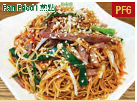
Pan Fried Noodles with BBQ Pork 豉油皇▽燒炒麵