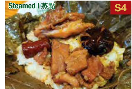
Sticky Rice in Lotus Leaf 古法糯米雞