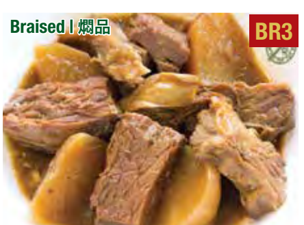
Braised Beef Brisket with Turnip (Daikon) 柱侯蘿蔔牛坑腩