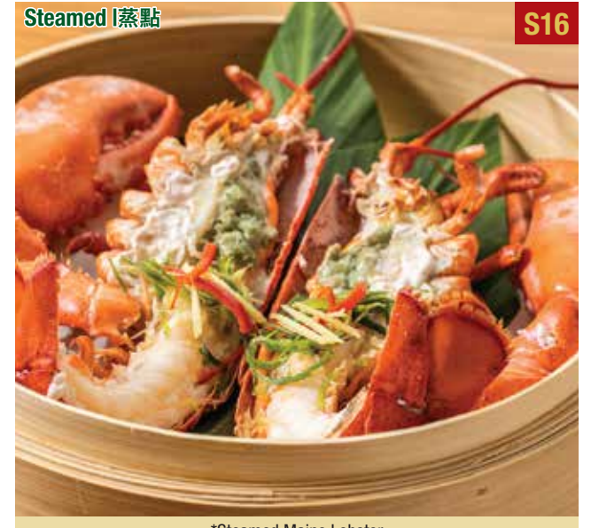
*Steamed Maine Lobster 清蒸龍蝦