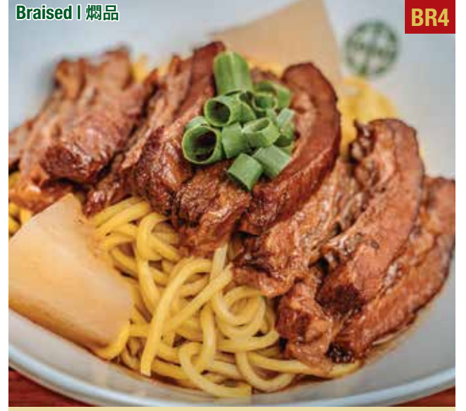
Braised Beef Brisket with Noodles 原汁牛腩乾撈麵