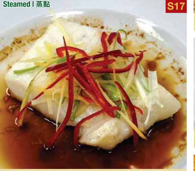
Classic Steamed Seabass 清蒸石斑