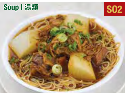
Braised Beef Brisket with Thin Rice Noodles in Soup 牛腩湯米粉