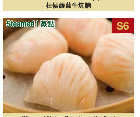
*Steamed Shrimp Dumplings (Har Gow) 晶瑩鮮蝦餃